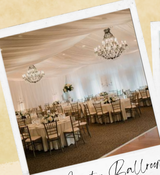
San Agustin Ballroom