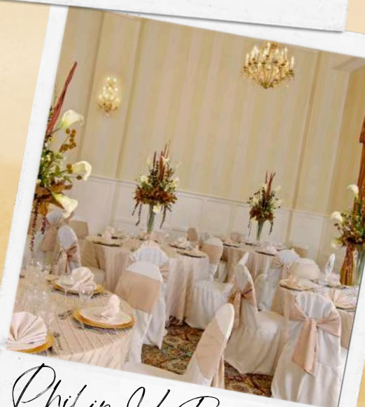
Philip V Ballroom